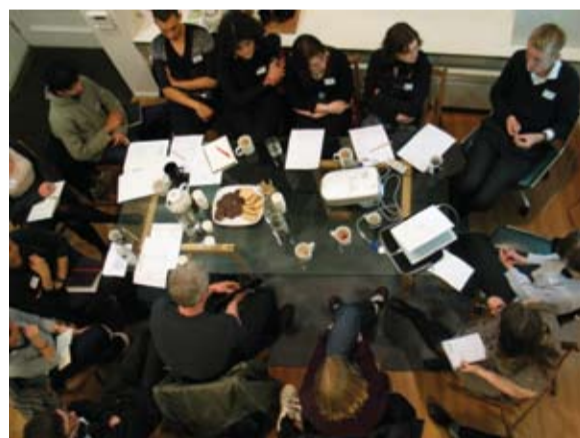
Left Standby Solutions , NWSP, 2008